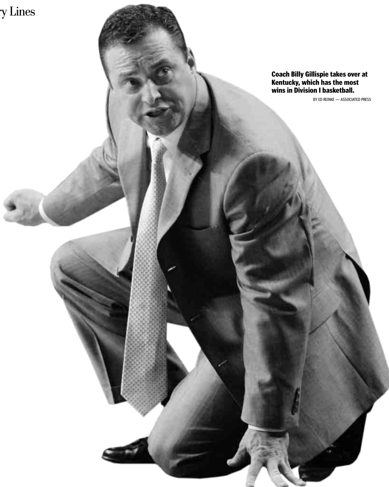
Coach Billy Gillispie takes over at Kentucky, which has the most wins in Division I basketball.

5. Square One in Gainesville No team lost as much as the two-time defending national champions. Florida lost its top six players, including three NBA lottery picks in Joakim Noah, Al Horford and Corey Brewer. At least the Gators kept their coach, but even that was not easy. Billy Donovan accepted the Orlando Magic job before deciding to stay at Florida.