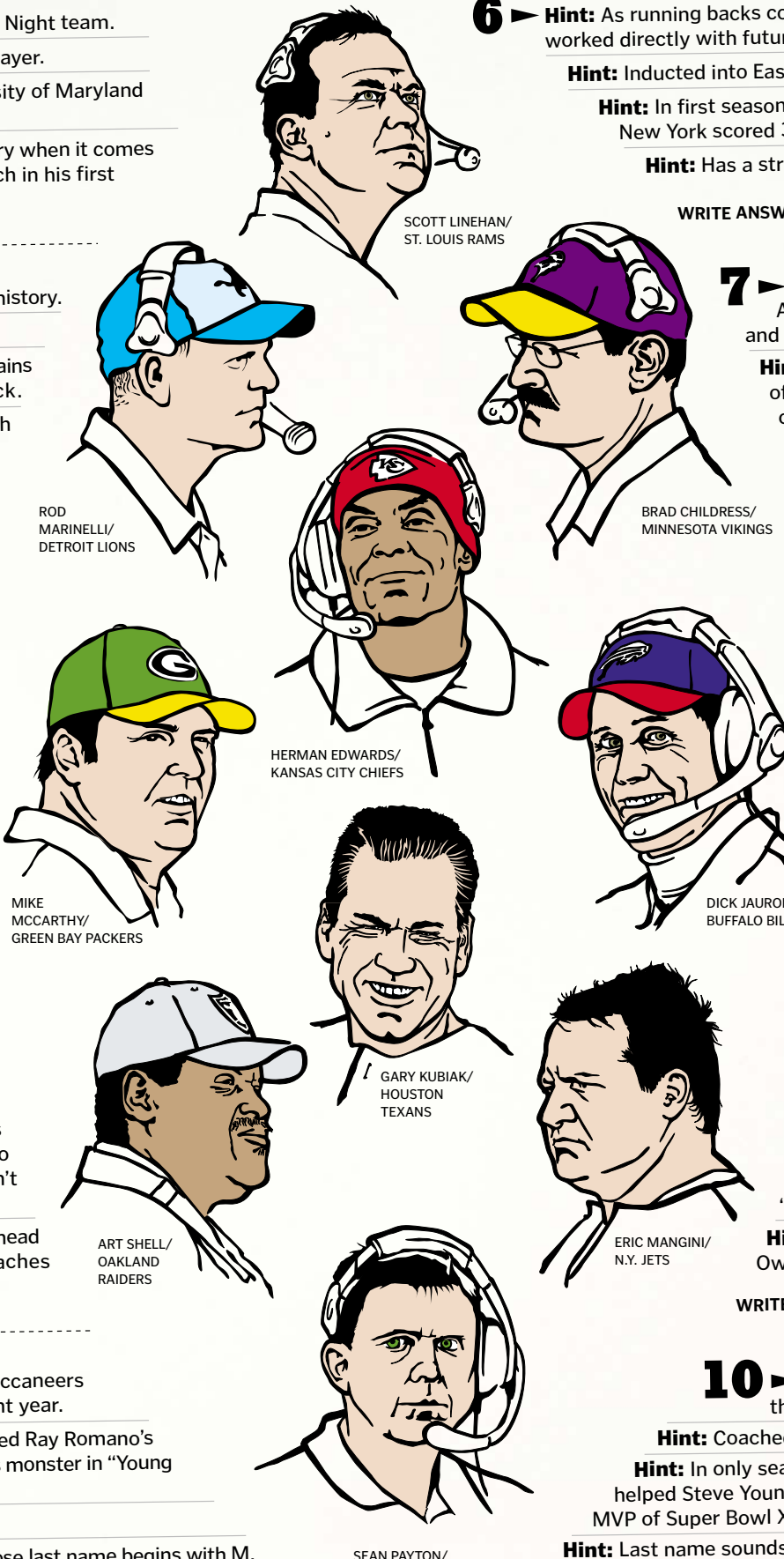
1. ART SHELL, OAKLAND RAIDERS; 2. ERIC MANGINI, N.Y. JETS; 3. SCOTT LINEHAN, ST. LOUIS RAMS; 4. HERMAN EDWARDS/KANSAS CITY CHIEFS; 5. ROD MARINELLI/DETROIT LIONS; 6. SEAN PAYTON, NEW ORLEANS SAINTS; 7. MIKE MCCARTHY, GREEN BAY PACKERS; 8. DICK JAURON, BUFFALO BILLS; 9. BRAD CHILDRESS, MINNESOTA VIKINGS; 10. GARY KUBIAK, HOUSTON TEXANS