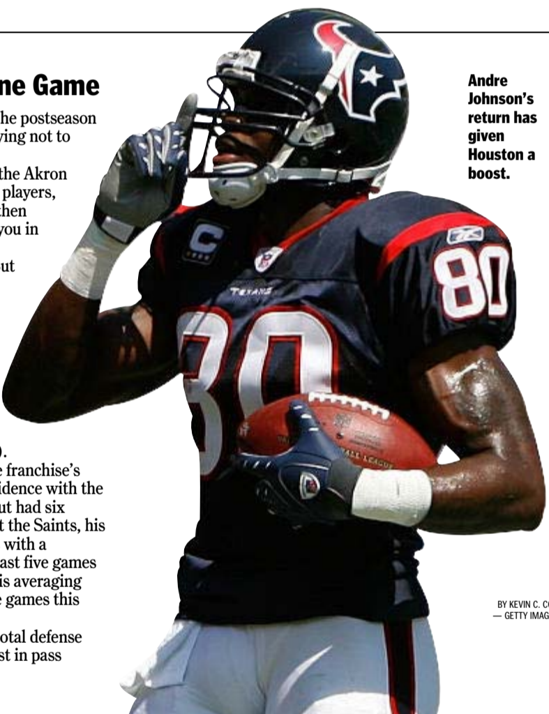
Andre Johnson's return has given Houston a boost.

The Browns, who haven't sniffed the postseason since 2002, are doing their best at trying not to get ahead of themselves. Or, as Coach Romeo Crennel told the Akron Beacon Journal of his message to his players, "Tell them if you look too far ahead, then what's right in front of you will kick you in the butt." Physically improbable? Perhaps. But today's game is an important one for Cleveland, which is currently tied with Tennessee for the AFC's sixth and final playoff spot. Since the Browns and Titans will not play in the regular season, their tiebreakers are conference record (Cleveland is 4-4, Tennessee 3-3) followed by record against common opponents (of which Houston is one). The Texans, whose 5-5 mark is the franchise's best after 10 games, have found confidence with the return of Andre Johnson. The wideout had six catches for 120 yards in a win against the Saints, his first game after missing seven games with a sprained knee. Houston has won its last five games in which it has played Johnson, who is averaging just over 127 receiving yards in three games this season. The Browns rank 32nd overall in total defense and points allowed per game, and 31st in pass defense.