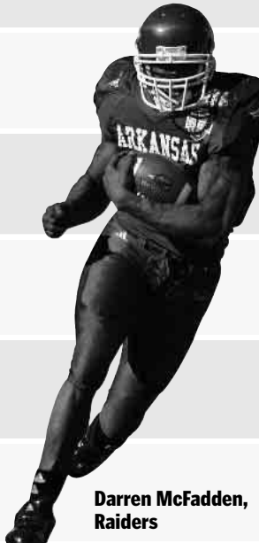
Darren McFadden, Raiders