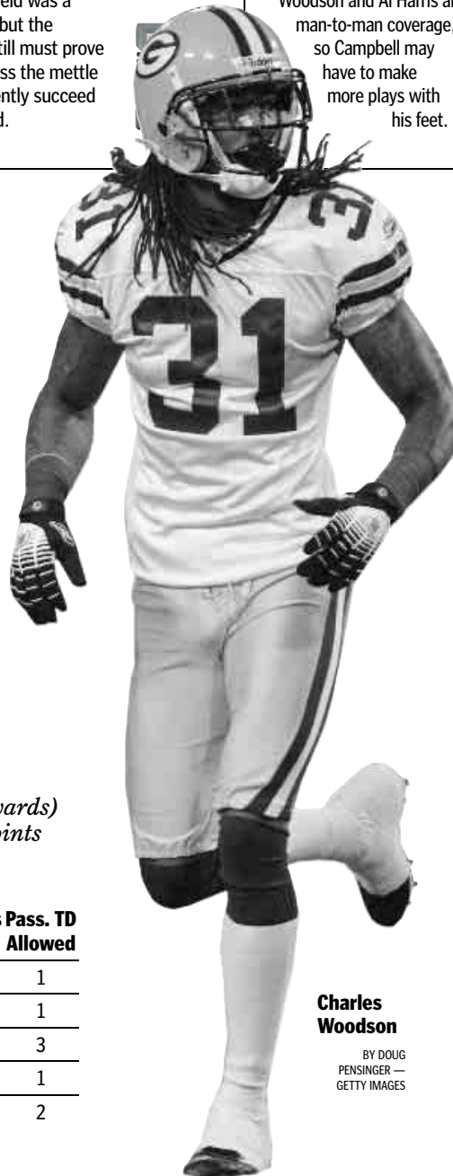
Charles Woodson