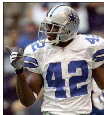
Dallas's Roy Williams missed a tackle against the Patriots. The Cowboys' secondary has been hurt by injuries to Terence Newman (41) and Anthony Henry (42).